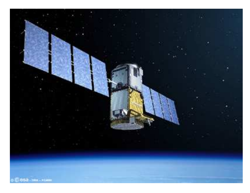
Artist's impression of GIOVE-B in orbit Credit: ESA Source: http://www.esa.int/esaNA/SEMZWWTQMFF index 0.html

time taken by the signal to arrive and calculate the distance from the satellite. Once the ground receiver receives the signals from at least four satellites simultaneously, it can calculate the exact position." (EC, 2003c, Galileo Official Website)