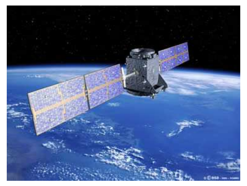
Artist's impression of GIOVE-A